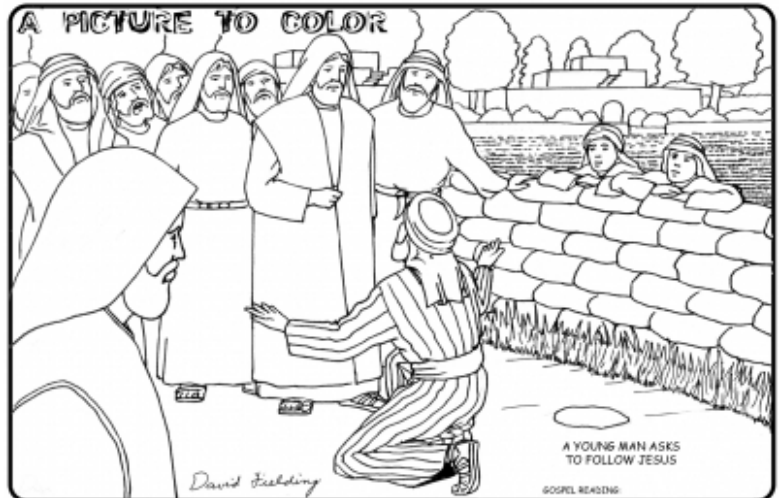
A PICTURE TO COLOR

The correct answers are: 1:(a); 2:(a); 3:(c); 4:(b); 5:(b)