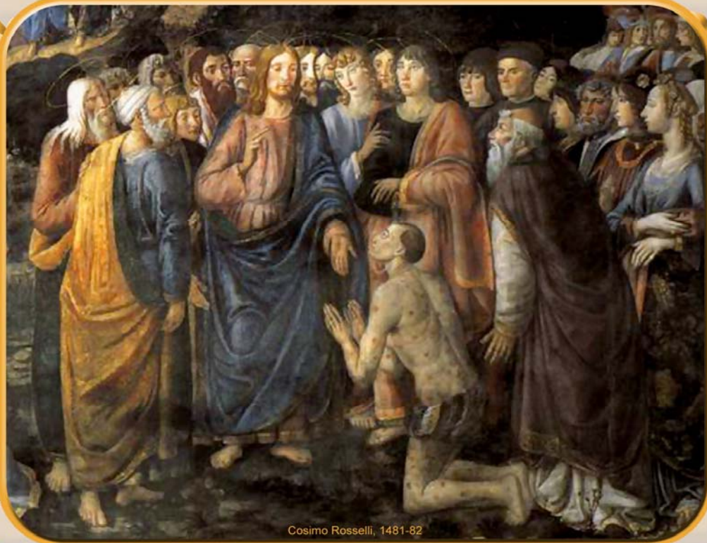
Cosimo Rosselli, 1481-82