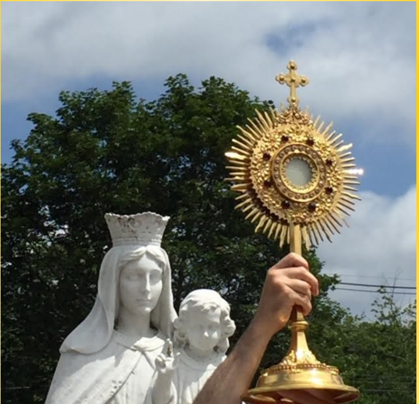
Image taken last week at the Eucharistic Procession following the 9:00 and 11:00am Masses as Our Lady's observed The Solemnity of the Body and Blood of Jesus Christ - "Corpus Christi"