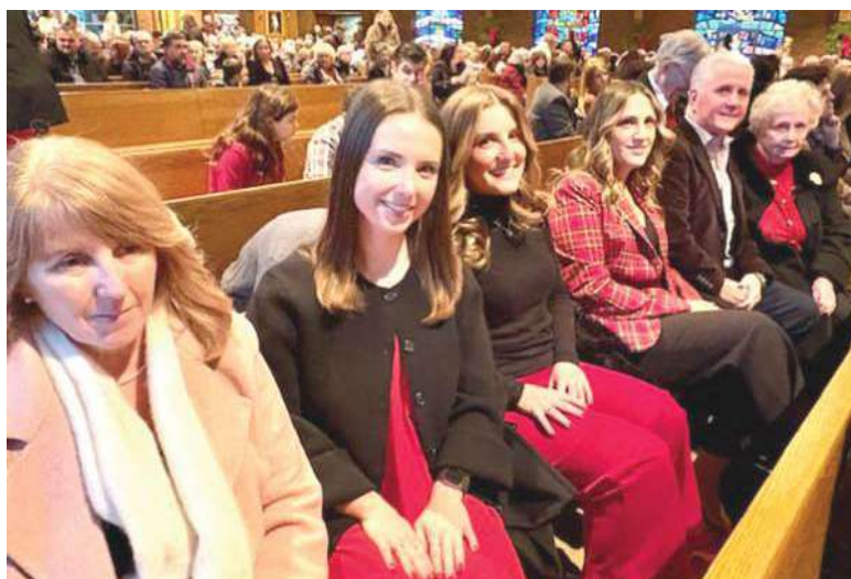
Beautiful Photo taken by parishioner Ron Bousquet.