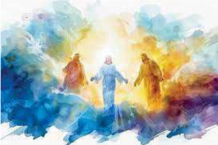
Feast of the Transfiguration of the Lord - August 6, 2025

You may scan this QR CODE to donate to the Parish anytime.