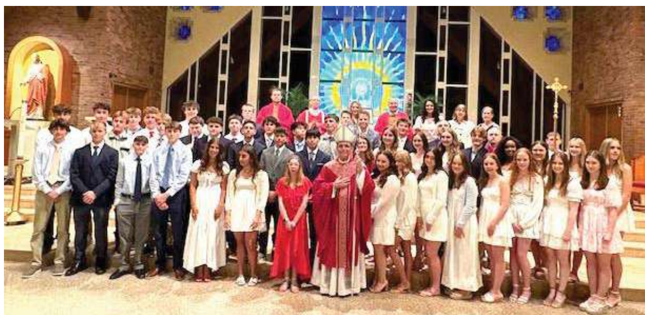
Feast of the Holy Family of Jesus, Mary and Joseph – December 28, 2025