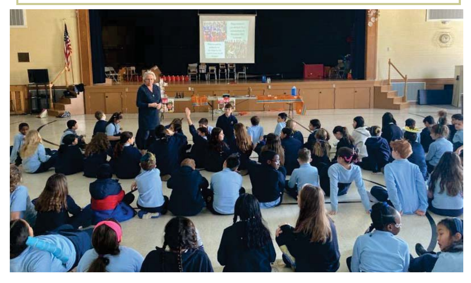
Presentation of the Lord-Sunday, February 2, 2025

Among many of the activities planned for the students at Our Lady's Academy during Catholic Schools' Week was a visit from Missionaries speaking about their work in Malawi, Africa caring for and teaching children there about the faith. The week will end with another Mass.